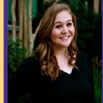
Class of 2013